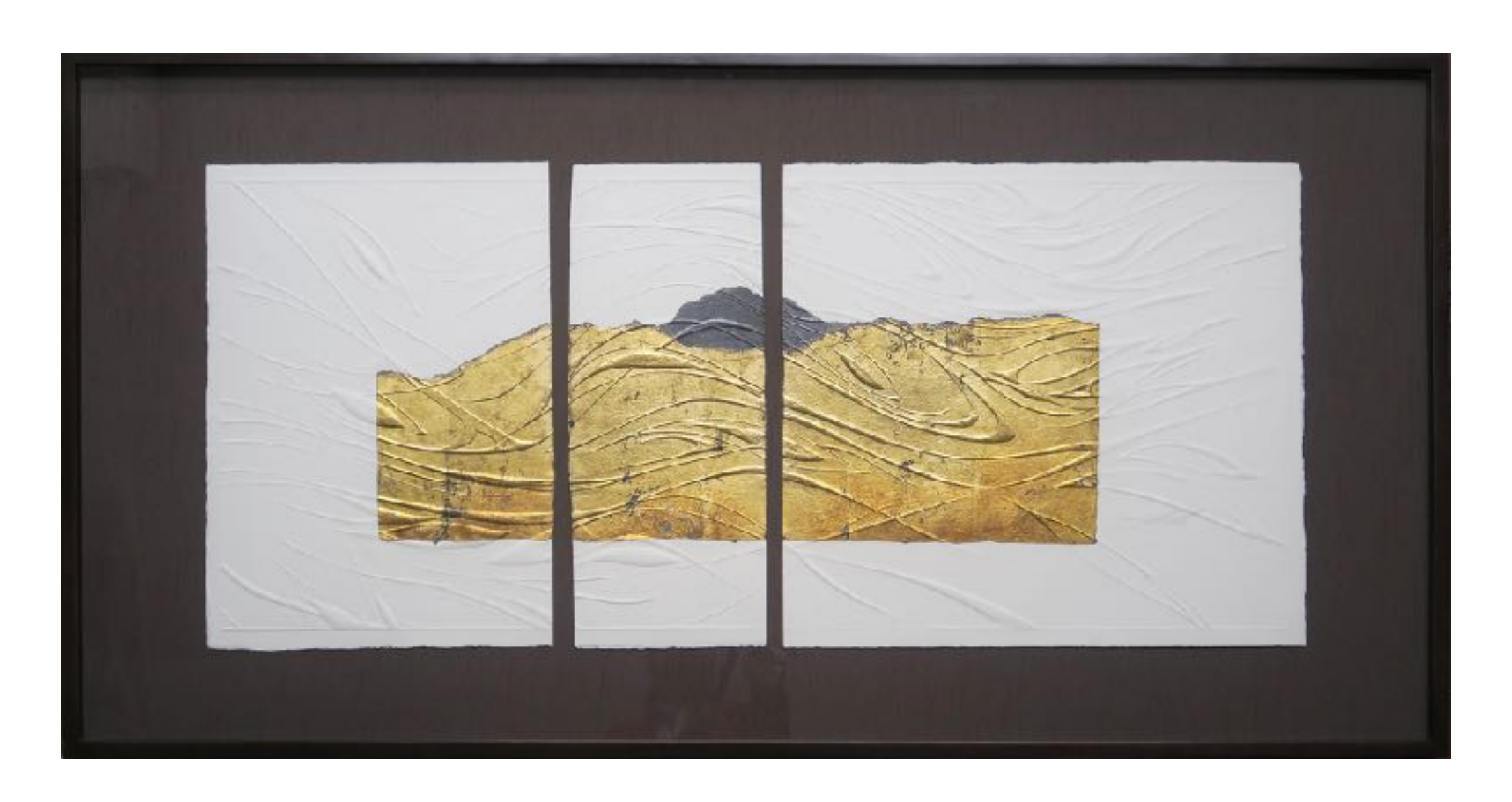
Dallas Art Fair