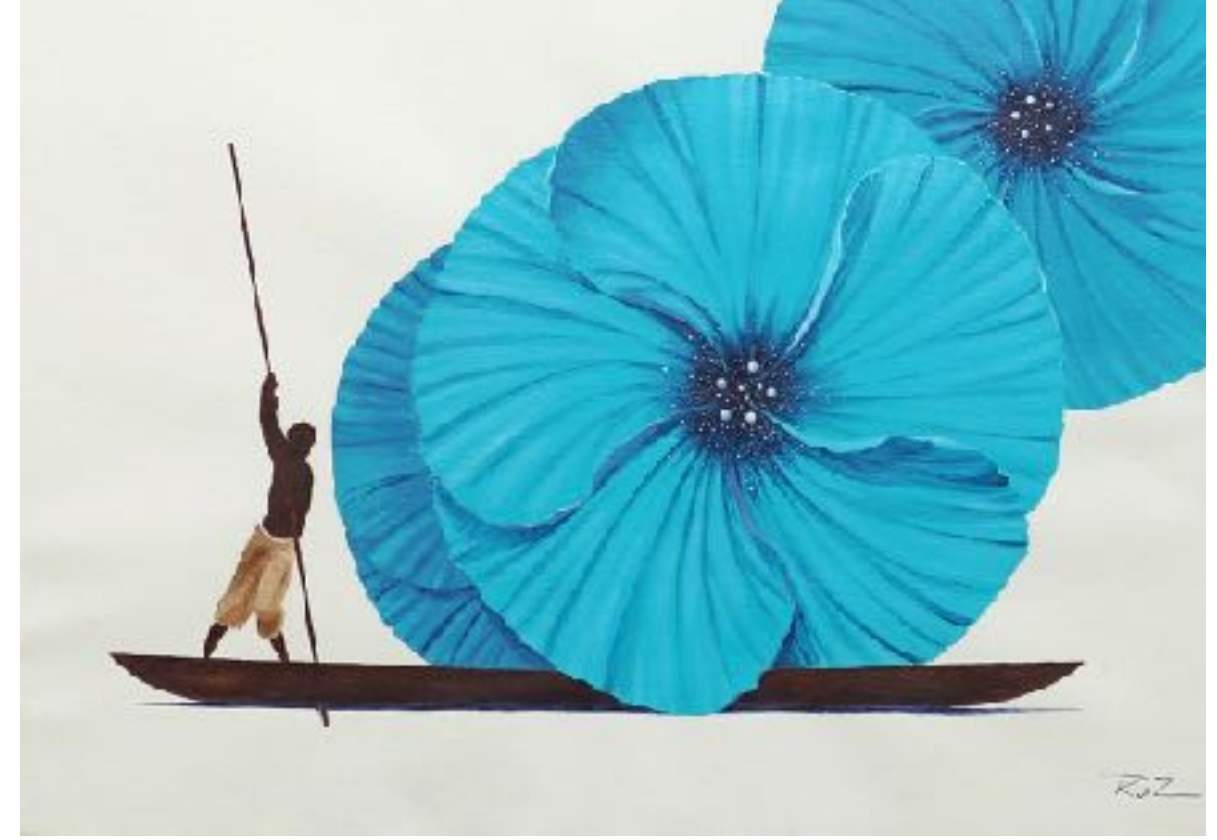
Santiago Uribe-Holguín, Shapes and Shades No.15, oil on paper, 30 x 40 cm.