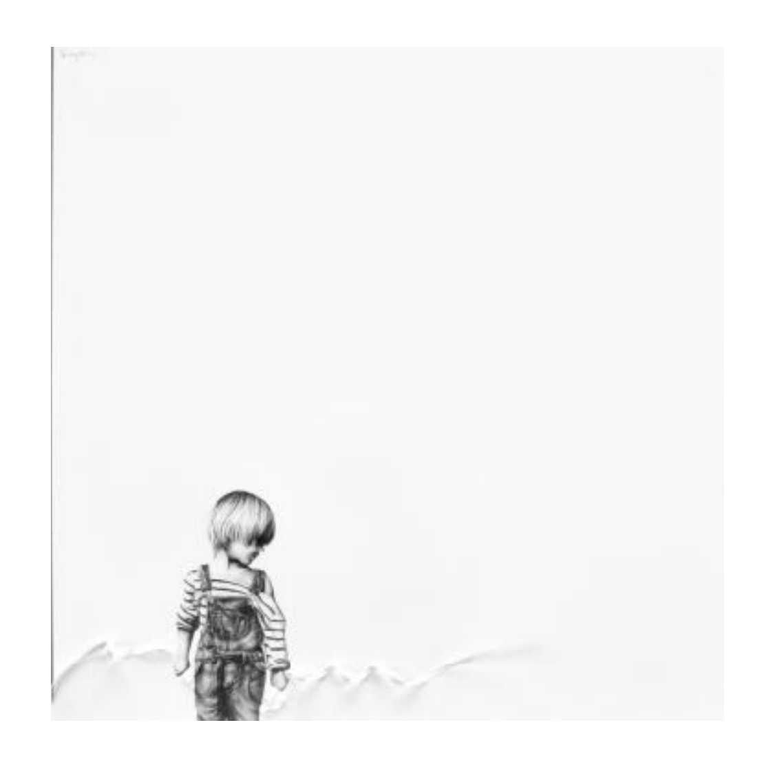
Pablo Arrazola, Apuchumala 21, 2021, colored pencils on cut cotton paper, 60 x 60 cm

Pablo Arrázola and Armando Castro-Uribe's subjects exist within vast spaces. These figures interact with the materials they've been drawn on, be it cardboard or paper. The atmosphere that surrounds them brings silence and mystery to the works, drawing the observer in.