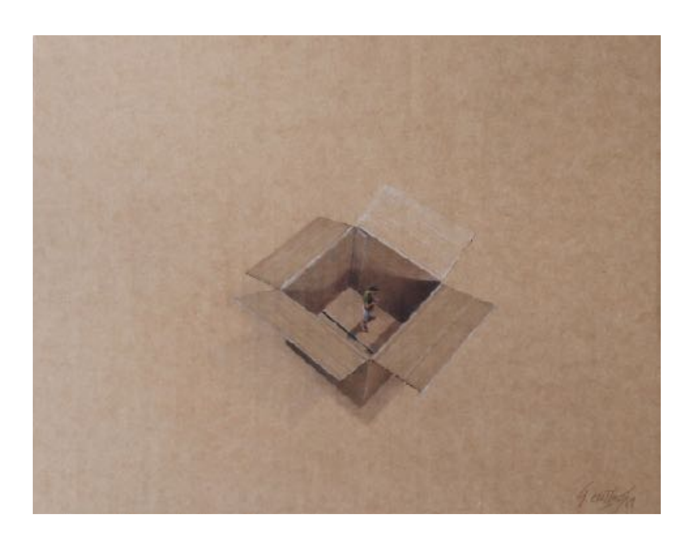
Armando Castro, Trapped, 2019,, mixed media on cardboard, 27 \times 35.5 \times 3 cm