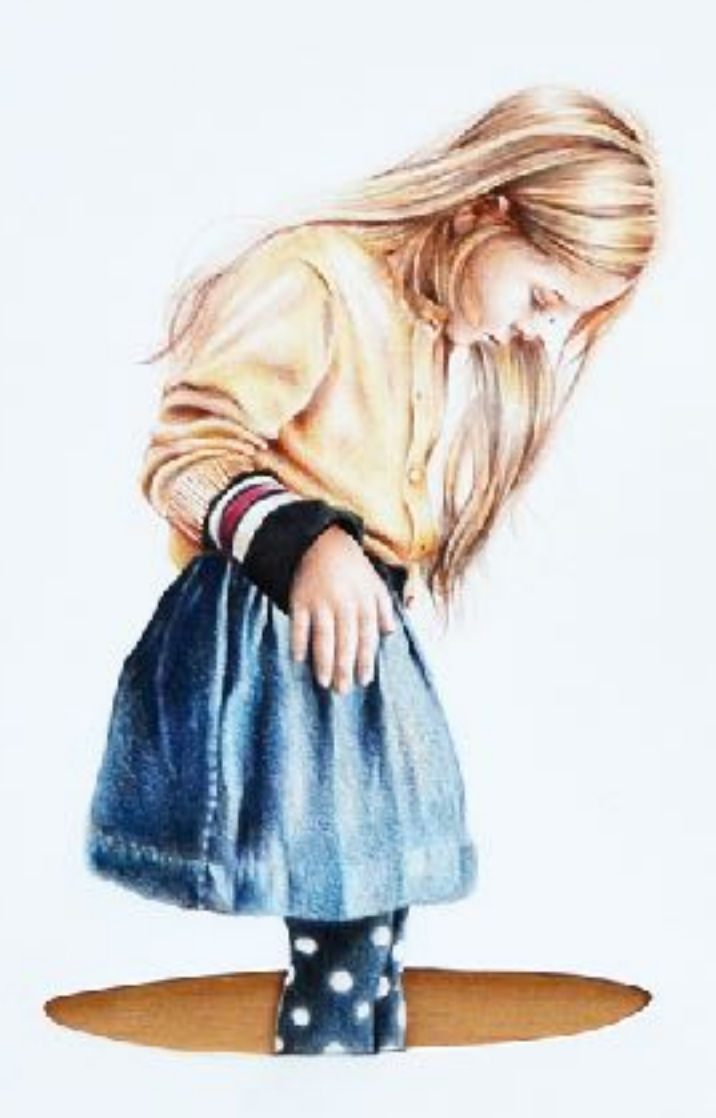
Pablo Arrazola, Apuchumala 20, 2021, colored pencils on cut cotton paper, 60 x 60 cm.

<u>Pablo Arrázola</u> and <u>Armando Castro-Uribe's</u> subjects exist within vast spaces. These figures interact with the materials they've been drawn on, be it cardboard or paper. The atmosphere that surrounds them brings silence and mystery to the works, drawing the observer in.