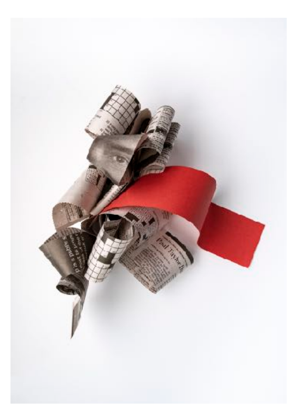
Jairo Llano, Who's the Dancer?, 2022, digital print, 70 x 100 cm.