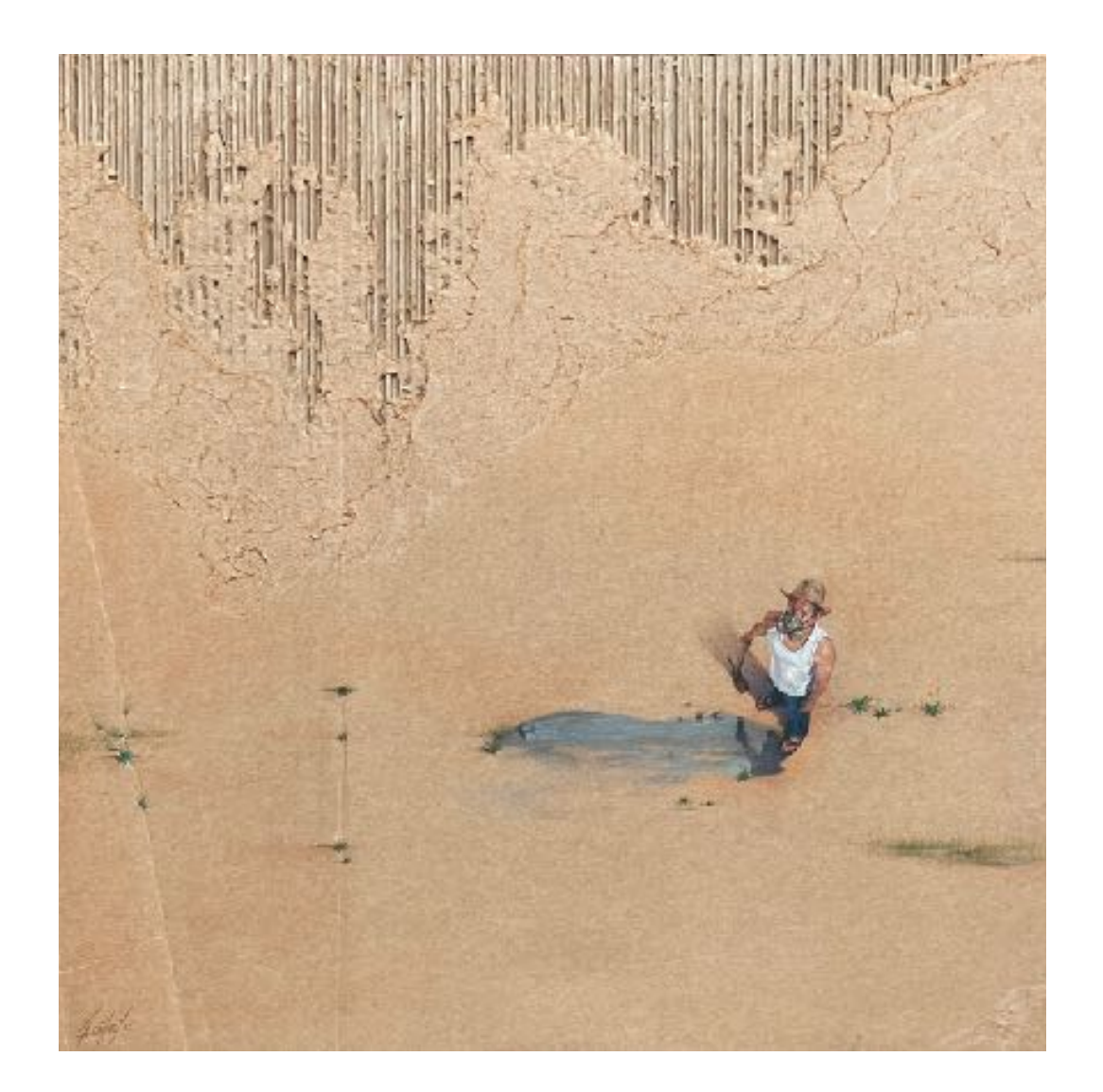
Armando Castro-Uribe, Bitter Sigh, 2022, mixed media on cardboard, 66 x 72 cm