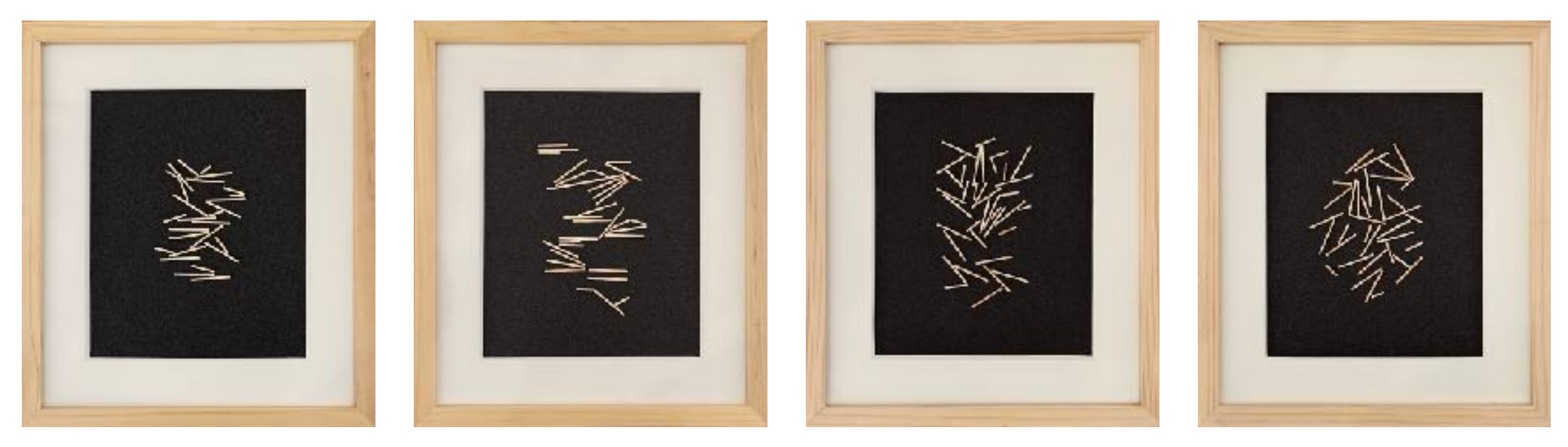
Jeronimo Villa, Blind 1,2,3 and 5, 2021, headless matches on sandpaper, 39.5 x 34.5 cm