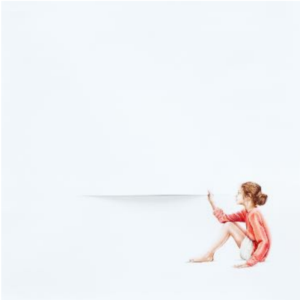
Pablo Arrazola, Apuchumala 21, 2021, colored pencils on cut cotton paper, 60 x 60 cm

Pablo Arrázola and Armando Castro-Uribe's subjects exist within vast spaces. These figures interact with the materials they've been drawn on, be it cardboard or paper. The atmosphere that surrounds them brings silence and mystery to the works, drawing the observer in.