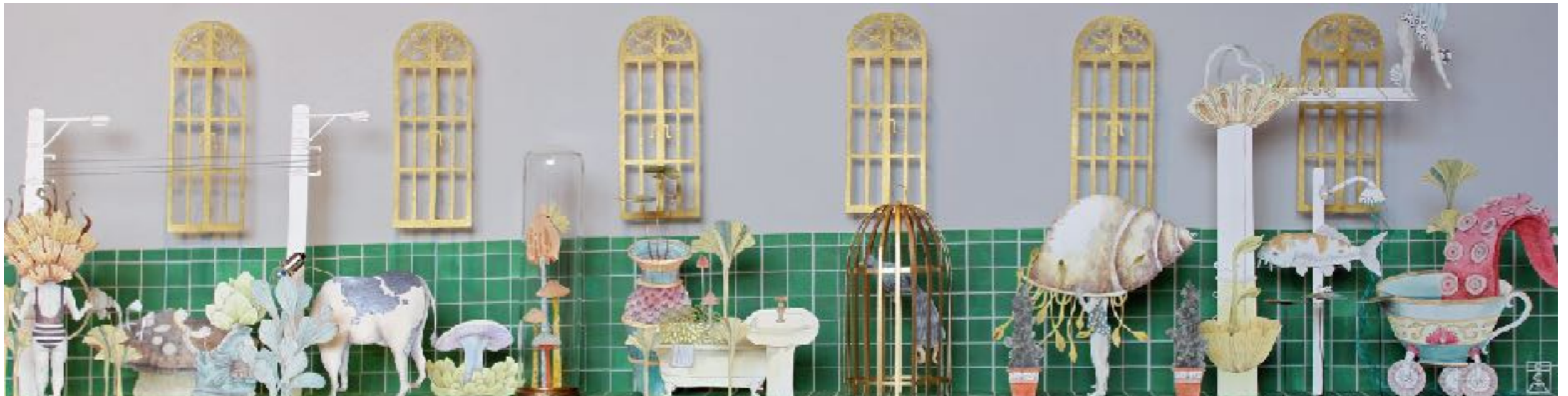
Teresa Currea, Fiction in Bathroom, 2019, mixed media on paper, 27 × 100 × 14 cm.

Teresa Currea takes drawing to the third dimension by assembling individual cut outs, drawn with ink, watercolor and other mixed media. Her compositions create fascinating surrealist worlds full of imaginary characters, objects and nature.