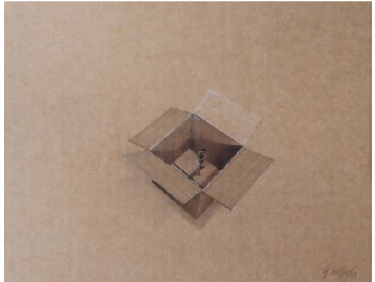
Armando Castro, Trapped, 2019,, mixed media on cardboard, 27 x 35.5 x 3 cm