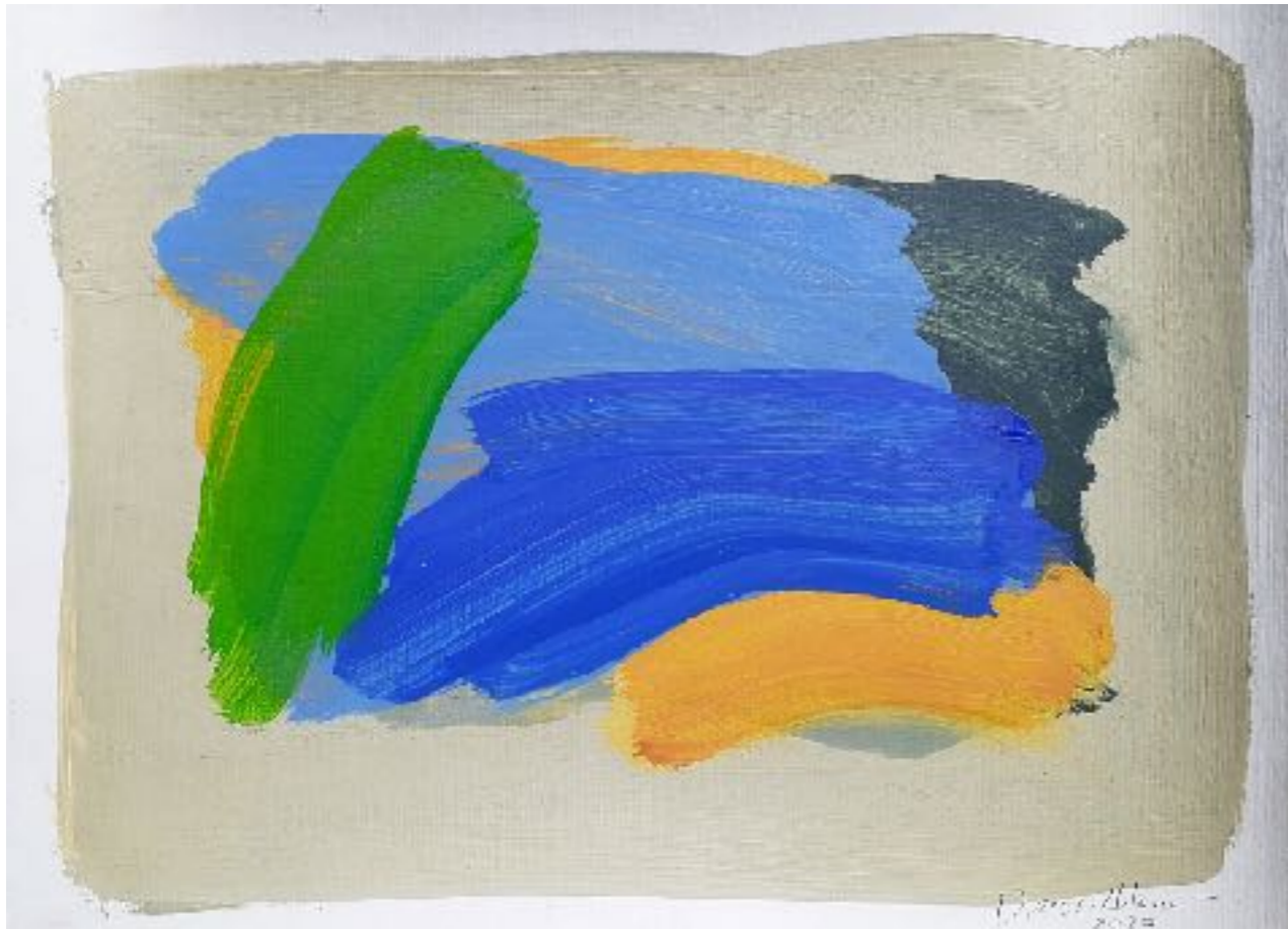
Santiago Uribe-Holguín, Shapes and Shades No.15, oil on paper, 30 x 40 cm.

Pedro Ruiz and Santiago Uribe-Holguin use their art to take over most of the paper or canvas' space. They command it with the use of bold colors and shapes. Although one is abstract and the other is figurative, their presence is always forceful and visible.