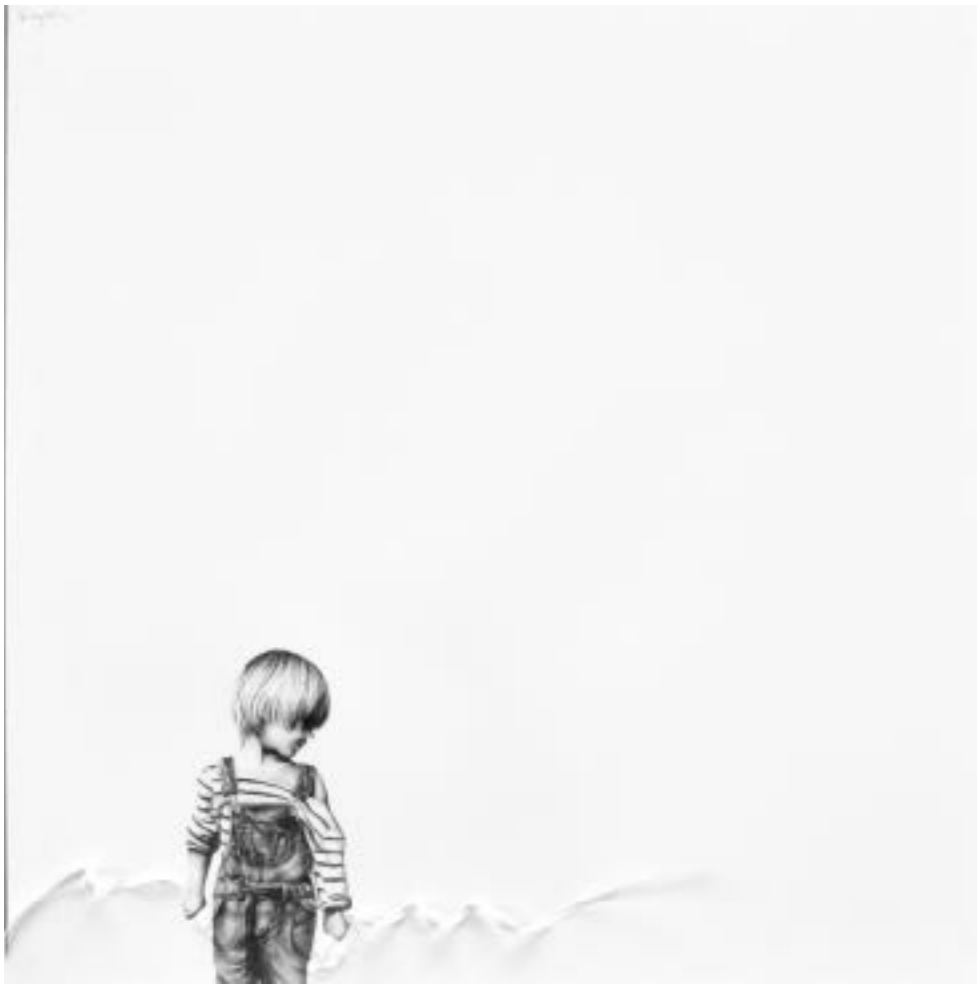
Pablo Arrazola, Apuchumala 21, 2021, colored pencils on cut cotton paper, 60 x 60 cm

Pablo Arrázola and Armando Castro-Uribe's subjects exist within vast spaces. These figures interact with the materials they've been drawn on, be it cardboard or paper. The atmosphere that surrounds them brings silence and mystery to the works, drawing the observer in.