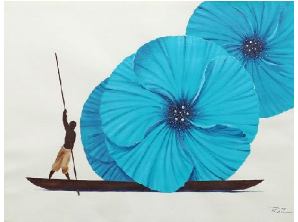
Pedro Ruiz, Displacement No. 218, 2020, acrylic on paper, 55 x 75 cm.