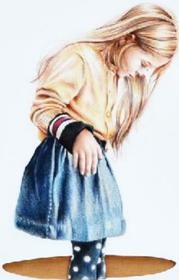
Pablo Arrázola, Apuchumala 20, 2021, colored pencils on cut cotton paper, 60 x 60 cm.

Pablo Arrázola and Armando Castro-Uribe's subjects exist within vast spaces. These figures interact with the materials they've been drawn on, be it cardboard or paper. The atmosphere that surrounds them brings silence and mystery to the works, drawing the observer in.