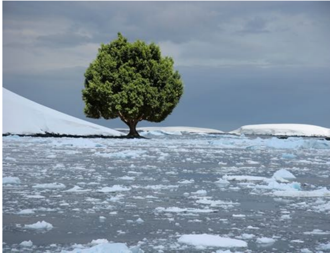
Max Steven Grossman, Antarctica No. 3, ed. 2/5, 2010, Digital print and plexiglass 50 x 60 in