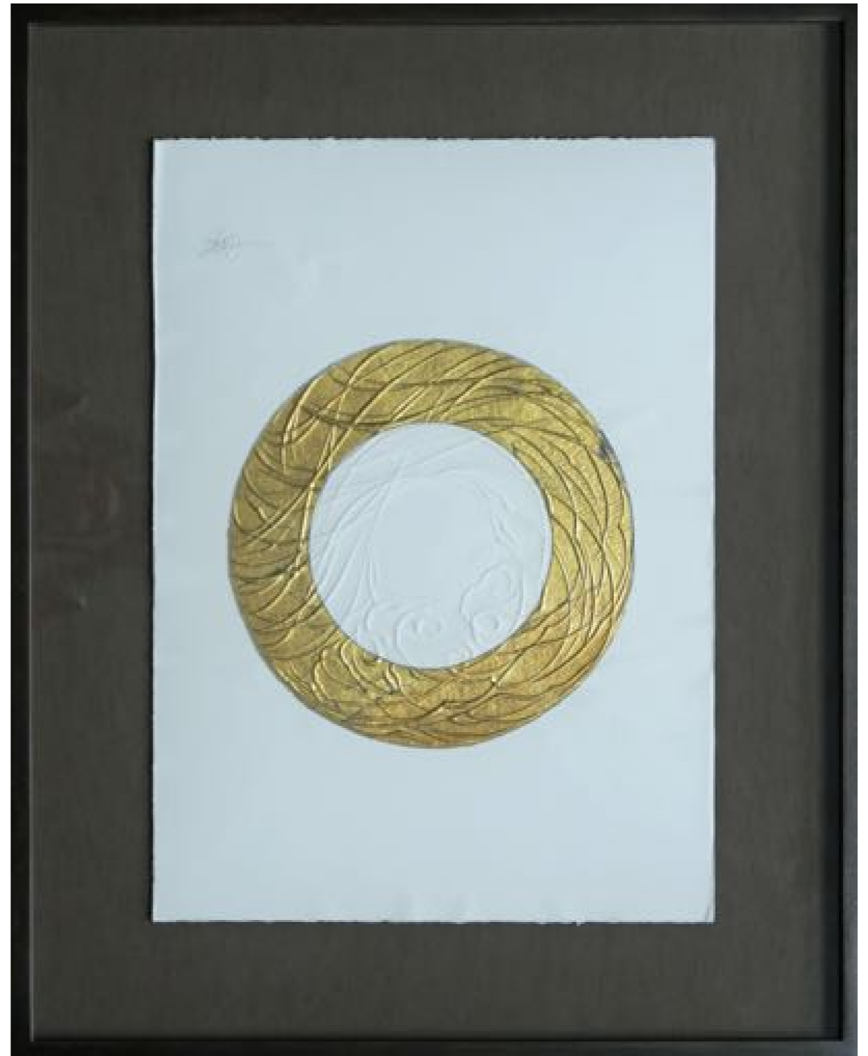
Pablo Posada-Pernikoff, Iguaque, 2017, embossed paper, metal relief, oxidations and gold leaf, 70 x 49 cm.

Pablo Posada-Pernikoff's abstract works show his fascination with light, shadow and time. He depicts the flow of matter in the elements: water, air, fire and earth. In his works the artist deepens his study of light and its manipulation, through the combination of embossed paper, gold and silver leaf and minerals.