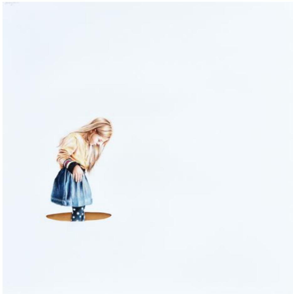
Pablo Arrazola, Apuchumala 20, 2021, colored pencils on cut cotton paper, 60 x 60 cm

Armando Castro-Uribe uses recycled surfaces to beautifully and skillfully depict his detailed figures, elevating common materials, like cardboard and mdf, to artistic levels.