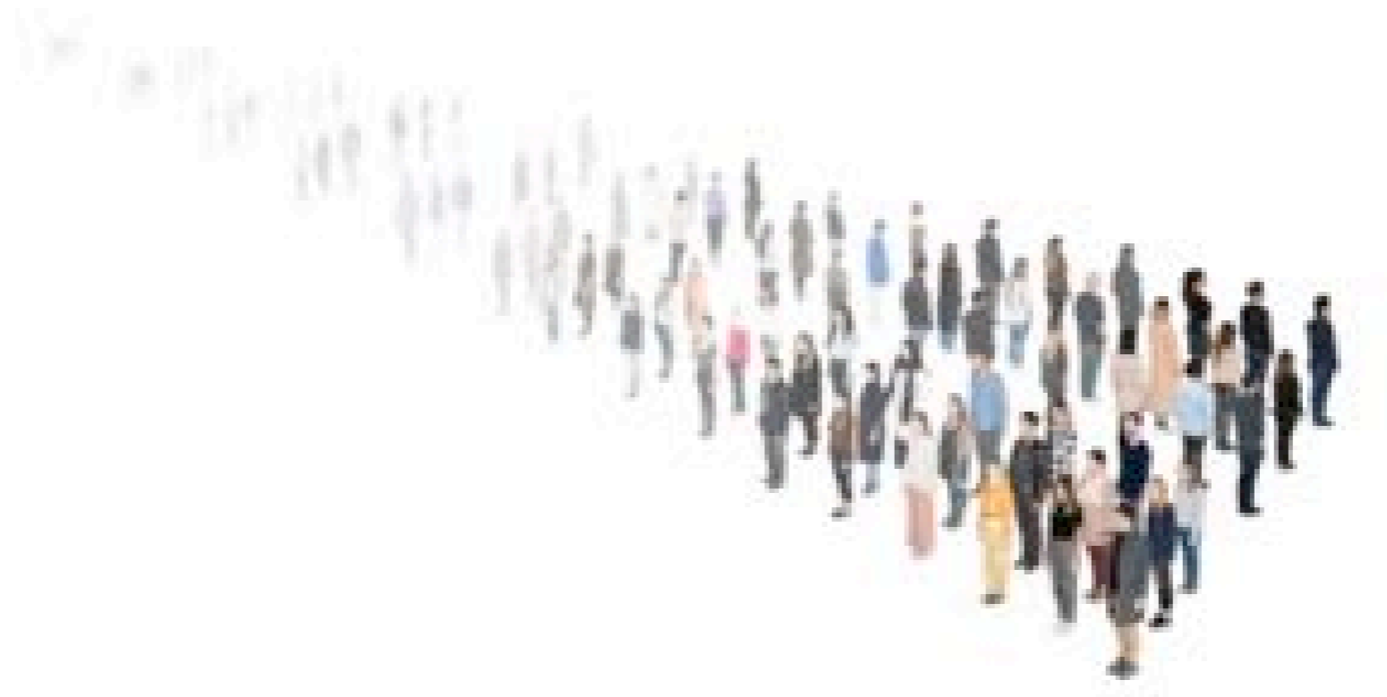
Mario Arroyave, Human Fabric 6 ed. 1/3, 2021, Gicleé print on cotton fiber paper, 70 x 70 cm.

The “Human Fabric” series is born from thoughtfully observing the matter that composes us. It is an interpretation of the theories of quantum physics that lead us to where all atoms vibrate and cluster, to exist briefly before becoming others. It is a clean and contemplative work that can take us to places of anguish or tranquility. It is in this ambivalence that we can find the power to generate new ideas about our own existence.