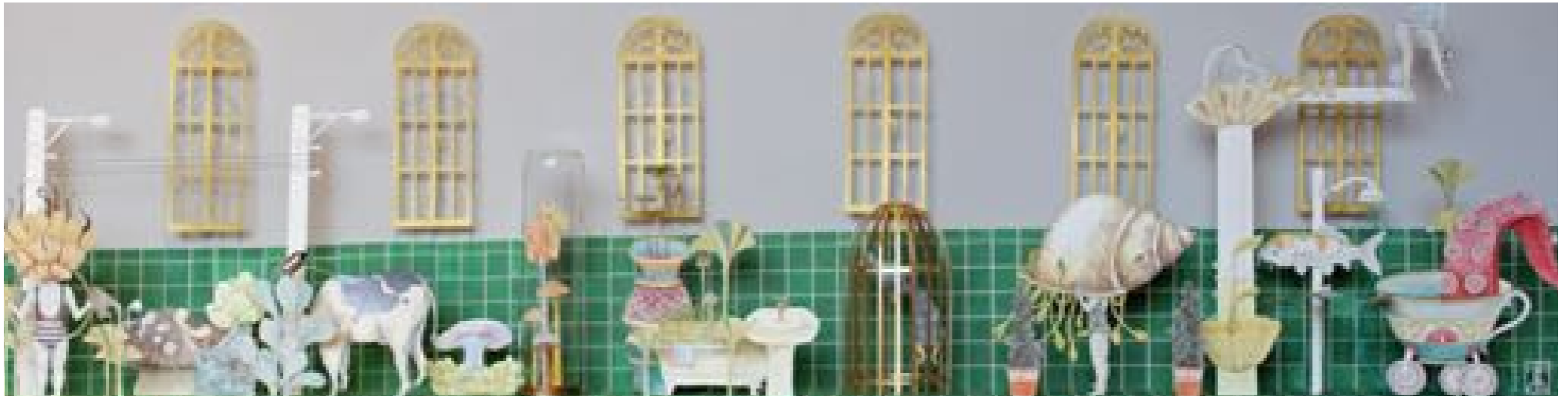
Teresa Currea, Fiction in Bathroom, 2019, mixed media on paper, 27 × 100 × 14 cm.

Teresa Currea takes drawing to the third dimension by assembling individual cut outs, drawn with ink, watercolor and other mixed media. Her compositions create fascinating surrealist worlds full of imaginary characters, objects and nature.