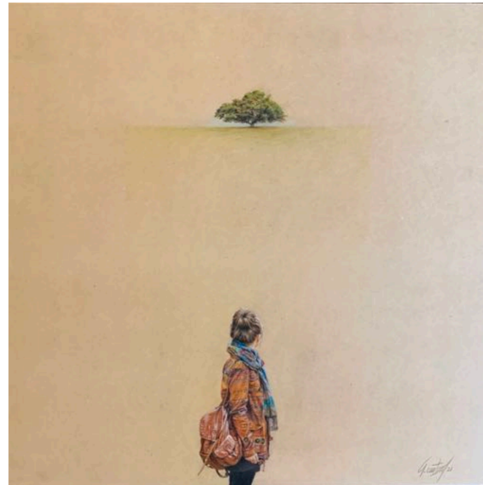
Armando Castro, Greta, 2021, mixed media on mdf, 40 x 40 cm