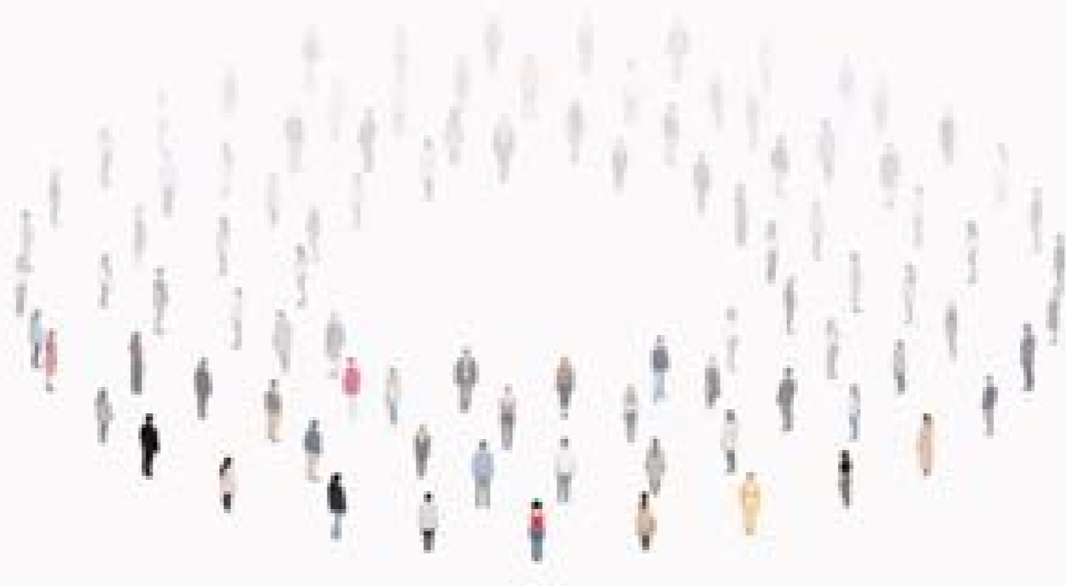
Mario Arroyave, Human Fabric 13, 2021, giclée print on conservation paper, 26.5 x 26.5 cm., ed. 2/5

The “Human Fabric” series is born from thoughtfully observing the matter that composes us. It is an interpretation of the theories of quantum physics that lead us to where all atoms vibrate and cluster, to exist briefly before becoming others. It is a clean and contemplative work that can take us to places of anguish or tranquility. It is in this ambivalence that we can find the power to generate new ideas about our own existence.