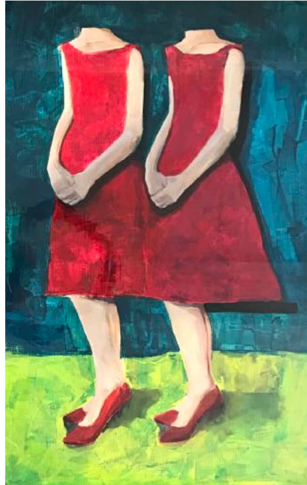
Carolina Convers, Mutable Vermillion, 2020 Acrylic and resin on cardboard, 124 x 84 x 3 cm

As an artist, Carolina Convers has consistently invoked the feminine figure, finding herself concerned with the construction of what is feminine in society: the virtuous and ideal archetype, encompassed in a suppressed, ordered, obedient and submissive female. Carolina Convers alludes to the confrontations we face in our daily lives: with society, our beliefs, our mere existence, and most significantly, ourselves.