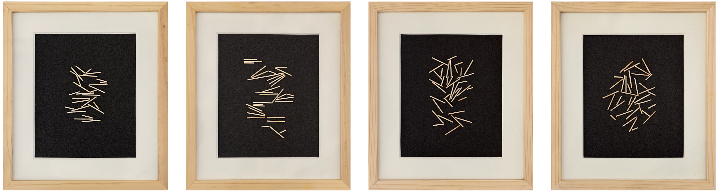
Jeronimo Villa, Blind 1,2,3 and 5, 2021, headless matches on sandpaper, 39.5 x 34.5 cm