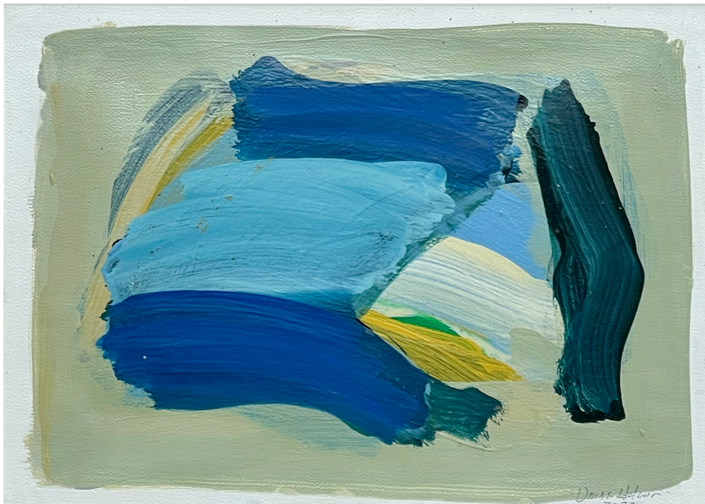
Santiago Uribe-Holguin, Shapes and Shades B, 2020, 35 x 50 cm.