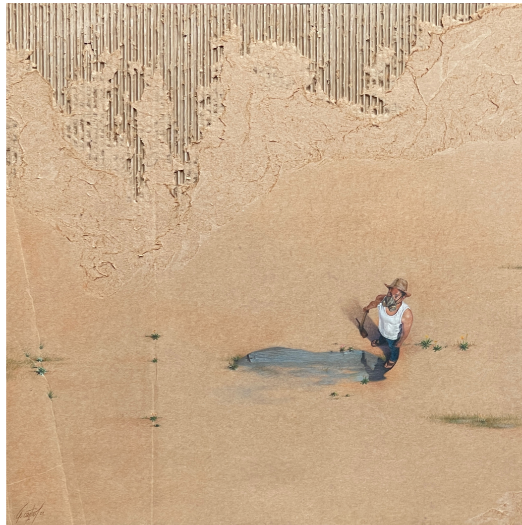
Armando Castro-Uribe, Bitter Sigh, 2022, mixed media on cardboard, 66 x 72 cm