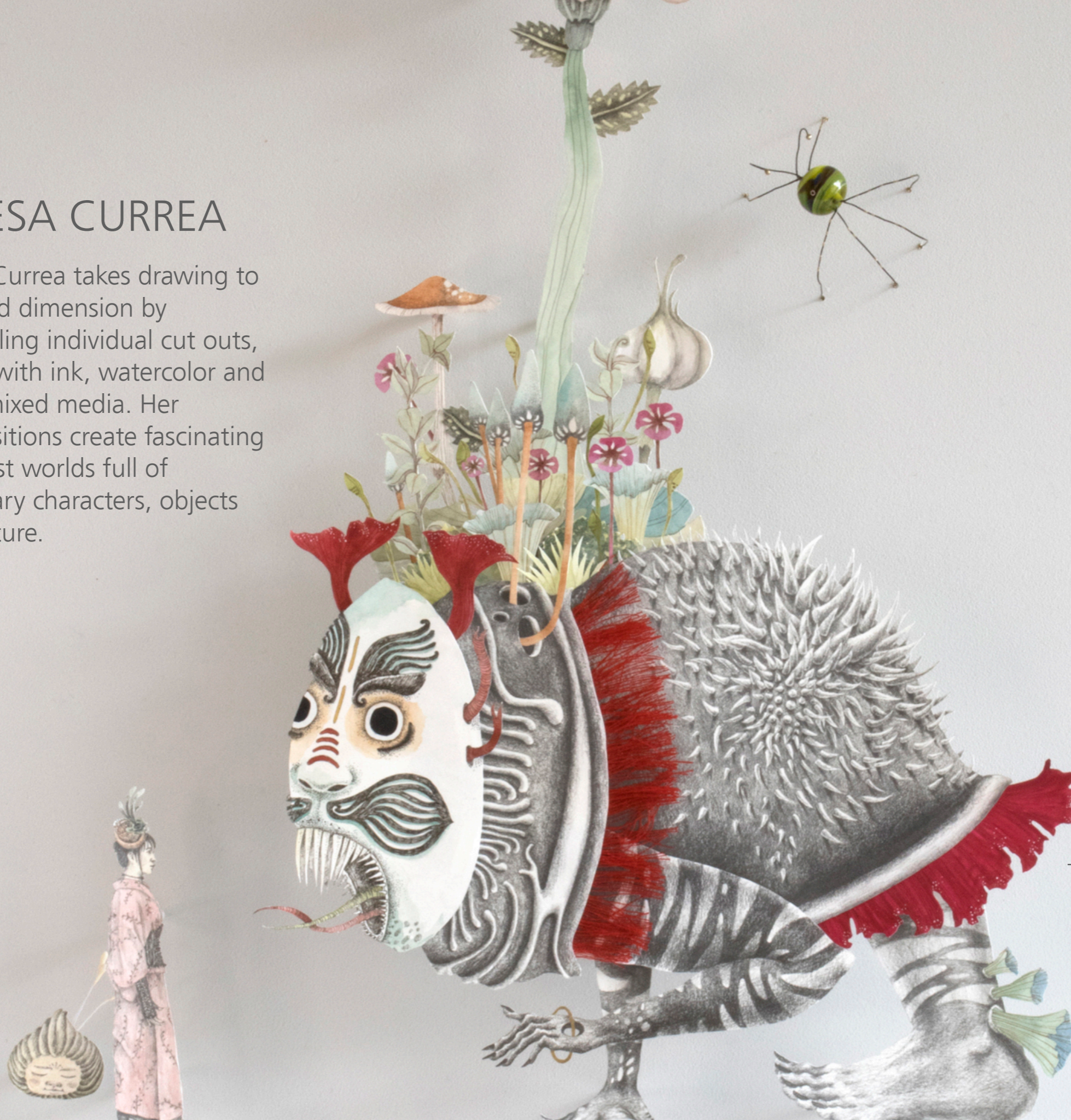
Teresa Currea, Meeting Daruma, 2021, mixed media on cut paper and glass object, 78 x 68 x 6 cm.

Teresa Currea takes drawing to the third dimension by assembling individual cut outs, drawn with ink, watercolor and other mixed media. Her compositions create fascinating surrealist worlds full of imaginary characters, objects and nature.